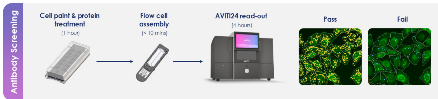
Figure 1. Teton Custom Antibody Screening Kit workflow.

To prepare custom antibody probes, combine your primary antibodies with Teton Custom Antibody Screen Proteins, which are coordinating molecules for your custom primary antibodies.