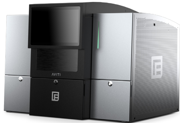
Figure 1. AVITI dramatically reduces sequencing costs and turnaround times while elevating the benchmark for genomic data, all in a compact benchtop format that fits into a variety of spaces.

An entry point to AVITI, the Element AVITI System LT runs both low- and medium-output sequencing kits to offer low-throughput and budget-friendly access to ABC. If future growth and expanded applications require a broader range of throughputs, labs can easily update the AVITI LT to an AVITI or AVITI24™ system.