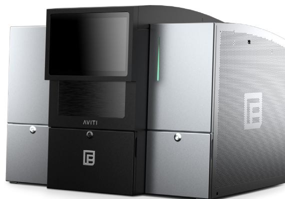
Figure 1. AVITI dramatically reduces sequencing costs and turnaround times while elevating the benchmark for genomic data, all in a compact benchtop format that fits into a variety of spaces.

An entry point to AVITI, the Element AVITI System LT runs both low- and medium-output sequencing kits to offer low-throughput and budget-friendly access to ABC. If future growth and expanded applications require a broader range of throughputs, labs can easily update the AVITI LT to an AVITI or AVITI24™ system.